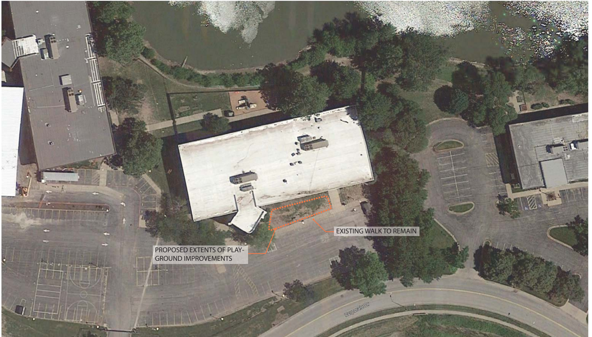
EXHIBIT "A" - PLAYGROUND LOCATION MAP